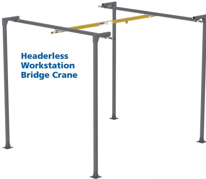
Headerless Workstation Bridge Crane