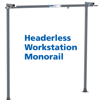
Headerless Workstation Monorail