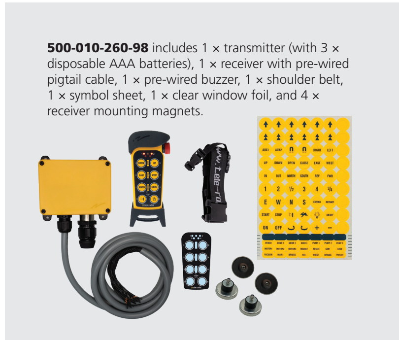
500-010-260-98 includes 1 x transmitter (with 3 x disposable AAA batteries), 1 x receiver with pre-wired pigtail cable, 1 x pre-wired buzzer, 1 x shoulder belt, 1 x symbol sheet, 1 x clear window foil, and 4 x receiver mounting magnets.