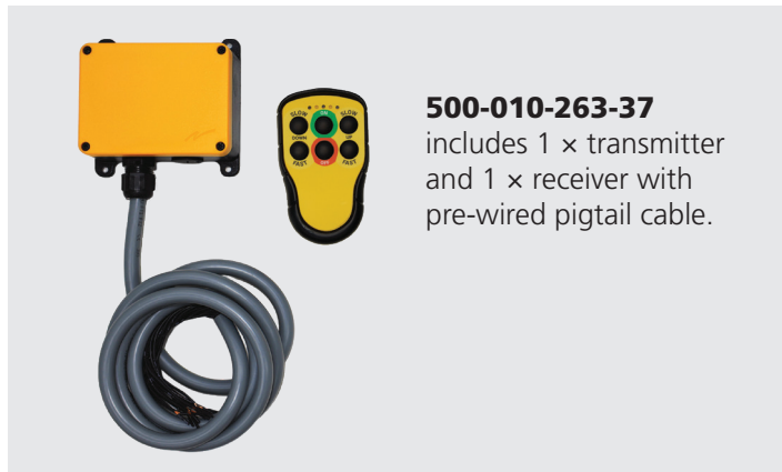
500-010-263-37 includes 1 x transmitter and 1 x receiver with pre-wired pigtail cable.